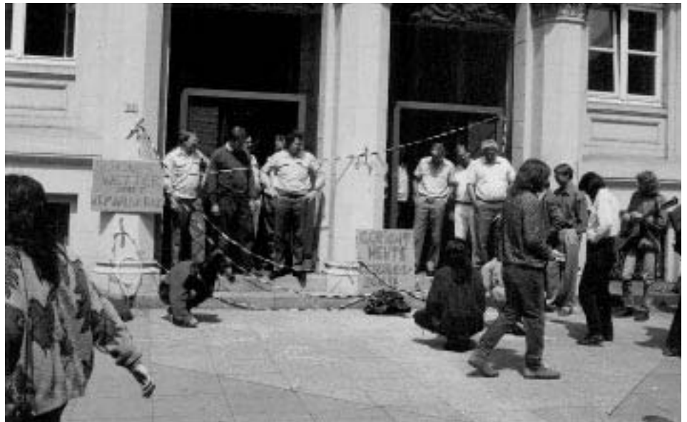
Solidarity action for total objectors. CO activists close a court in protest against criminalisation of total objectors. The banners read: "good weather instead of criminalisation" and "court closed today"

War Resisters' International 5 Caledonian Road London N1 9DX, Britain email: info@wri-irg.org