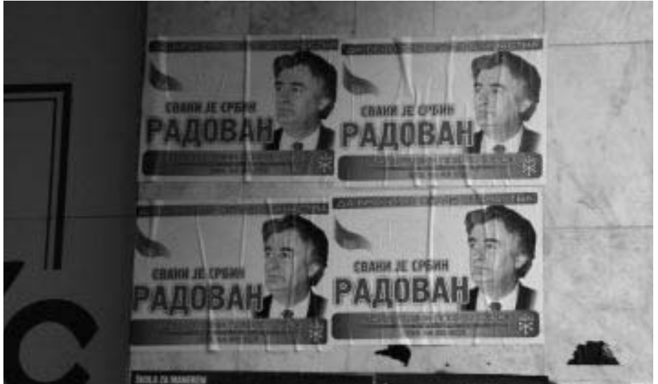
Belgrade is full with posters declaring "We are all Karadzic", protesting against extraditing the former Bosnian-Serb leader to The Hague.

opinions, as stated in his suicide letter, is an obvious example of how cheap life is in Serbia. If he didn't appreciate his own life, we can only imagine how valuable were lives of others to him, lives of police officers he commanded, or lives of the people he fought against in Kosovo and elsewhere, regardless of whether they were in uniforms or not.